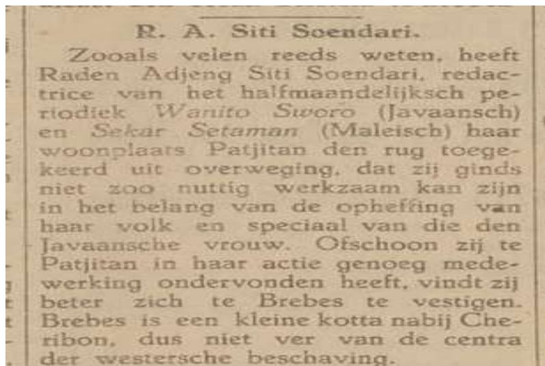
Figure 3. Newspaper discussing Wanito Sworo

The advancement of technology has contributed new sources for historians that are presented in digital form. History learning cannot be separated from the history curriculum. The selection of history learning resources must automatically consider the desired competencies of the history curriculum. To find out the relevance of using the Wanito Sworo newspaper archive as a history learning resource, identification of learning materials is carried out based on the learning outcomes of history at the high school level in the Merdeka Curriculum. The relevance of using Wanito Sworo newspaper archives as a history learning resource can be seen from the following magazine.