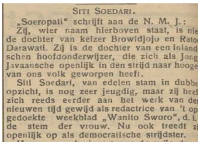
Figure 2. Newspaper discussing Sitti Soedari

This newspaper thoroughly explores the concerns of women in 1913-1917. The history book published by Kemendikbudristek in 2021 has very little to say about the press. In chapter 2 with the title Indonesian National Movement, the discussion of the press is only about Soenting Melajoe and Poetri Hindia magazines. In fact, Wanito Sworo newspaper also has the potential to be explored